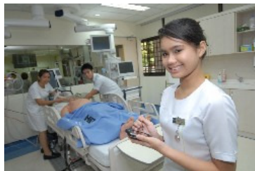
Students get a dose of reality

Built at a cost of S$1.4 million (US$918,639), the new facility includes two intensive care units, two emergency rooms and four manikins costing S$80,000 (US$52,499) each. It also houses an operating theater complete with gases typically used in surgeries, a gerontology unit, and a neonatal intensive care unit.